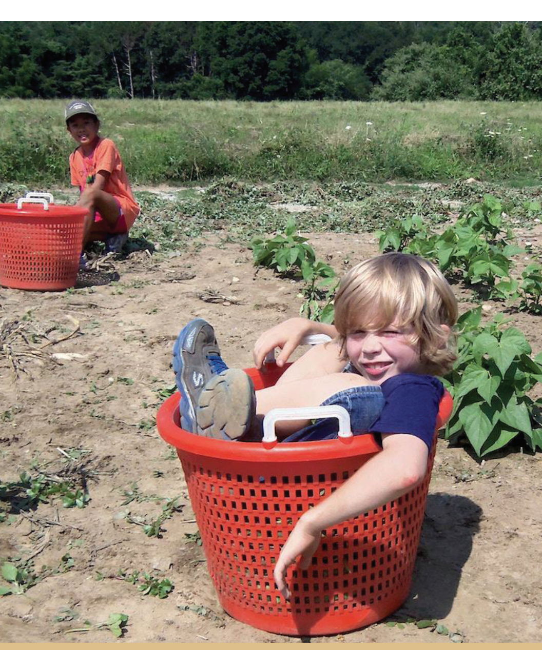
Mass Audubon's Drumlin Farm Wildlife Sanctuary, Lincoln, MA